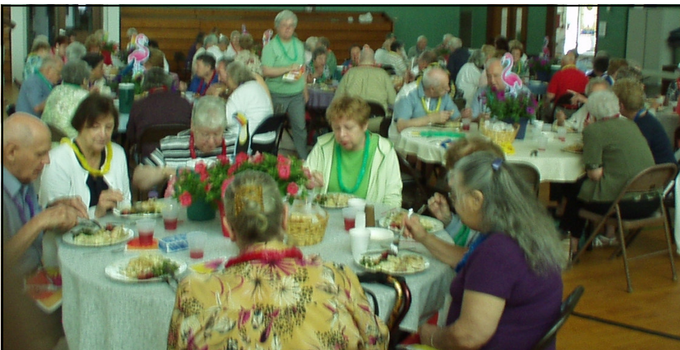
Photos from Senior Luncheon, June 4, 2011